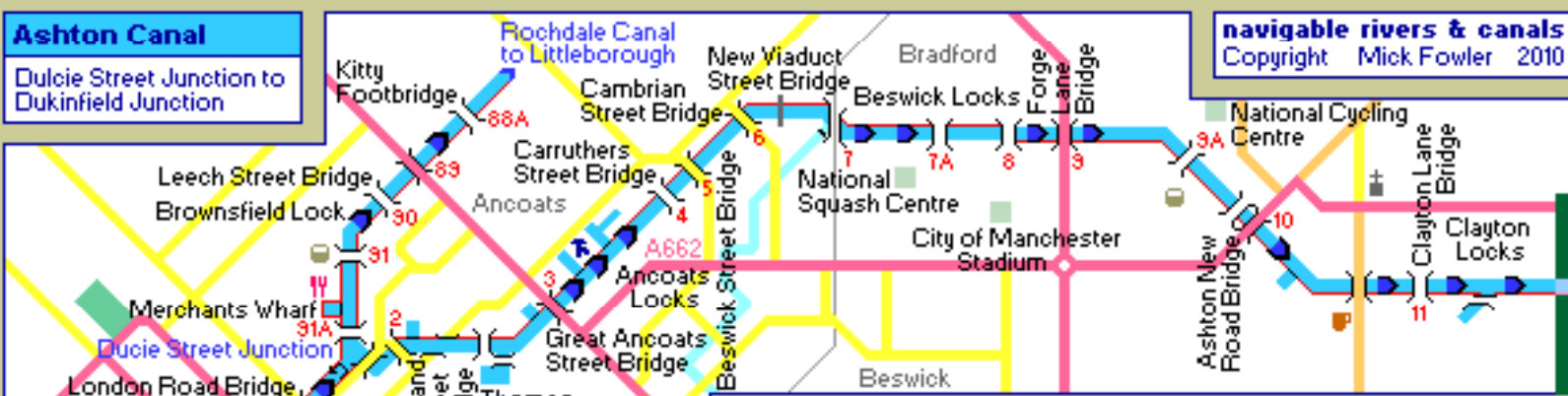
navigable rivers & canals